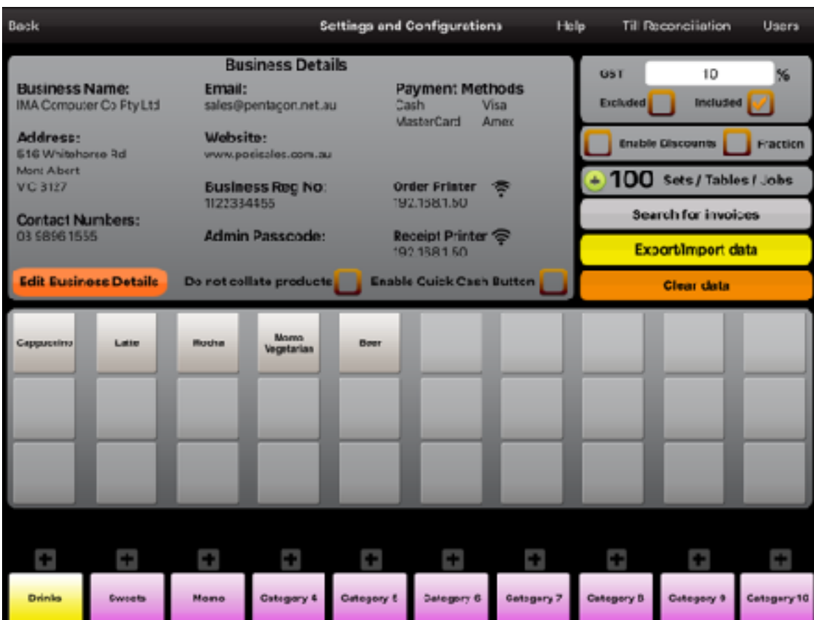
Figure 2. POSiSales Settings screen

Once you enter the Settings window, you will see the following screen: