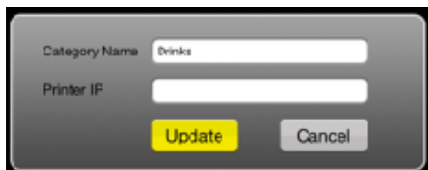
Figure 5. Category setting

To set the category tabs, tap on the plus + sign above the category name. This screen ( Figure 5 ) will appear and you can change the name of the category. You are also able to set a specific printer IP address here if you need the orders for products in this category to be forwarded to a different printer than your default order printer in the main settings. This does not change the receipt