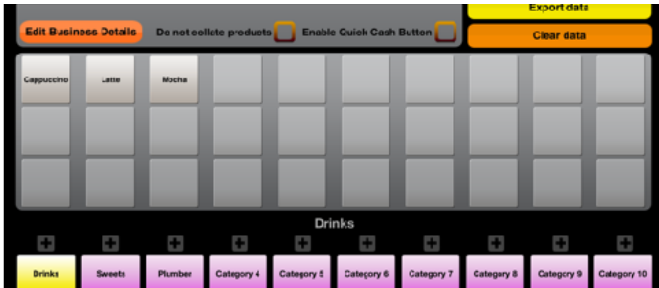
Figure 4. Setting up product/service items

Now at the bottom half of the Settings screen, you can start entering your products/services to build your POSiSales database. Please note that POSiSales is able to categorise your products/services (up to 40 different categories), with each category able to hold up to 30 different items, a total of 1200 products in the full version.