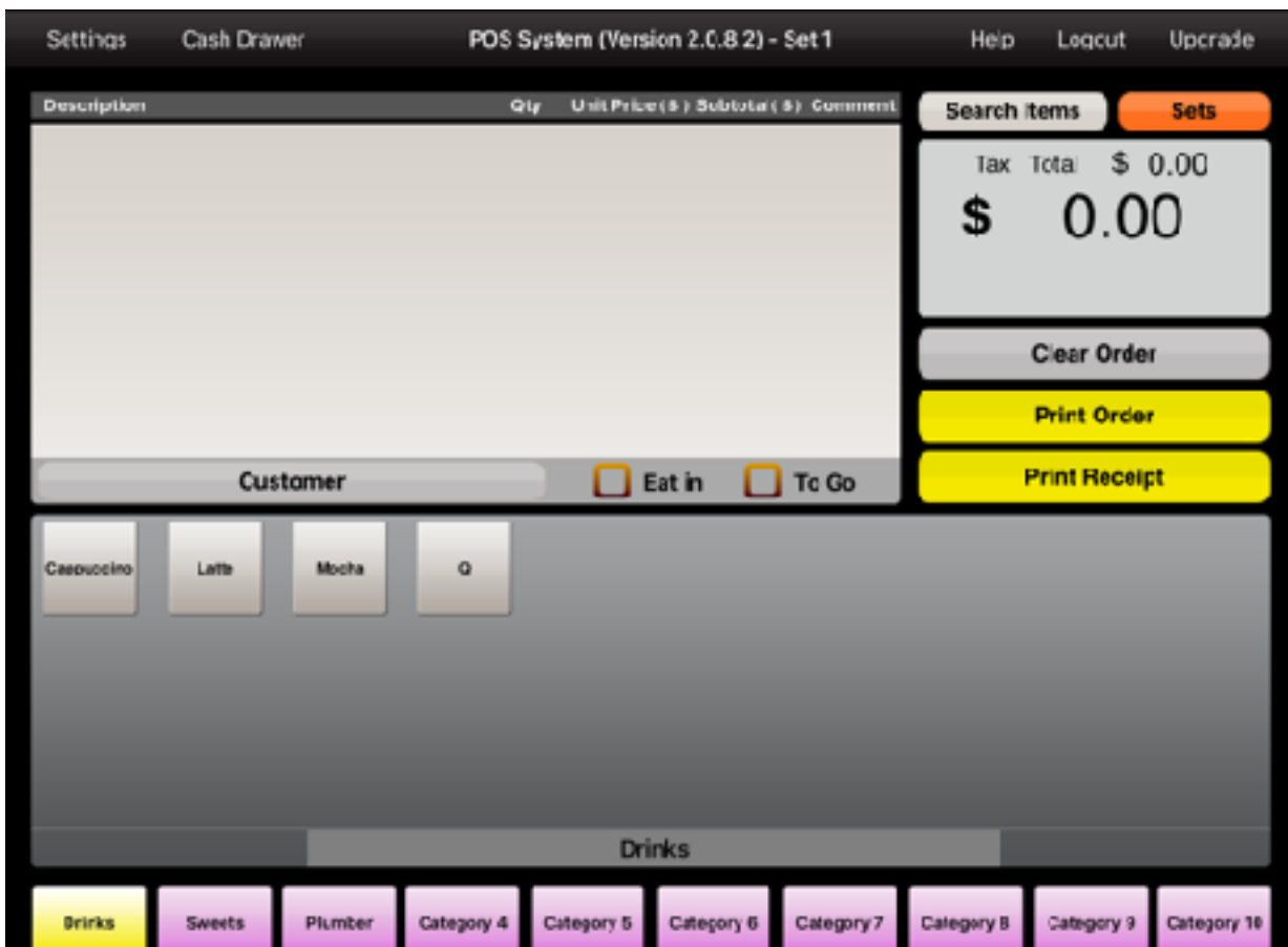
Figure 1. POSiSales main invoicing screen

Otherwise, click on the Settings button on the top left corner to get started.